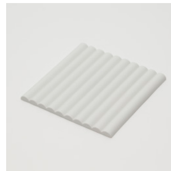
PN: TA/030 Name: Tray Color: White Size: W200 D200 H10 Price: ¥3,000