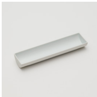
PN: TA/028 Name: Pen Holder Color: White Size: W200 D50 H25 Price: ¥2,000