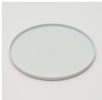
PN: TA/010 Name: Plate 260 Color: White Size: φ260 H14 Price: ¥5,100