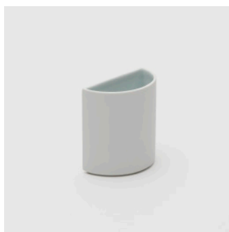
PN: TA/032 Name: Vase S Color: White Size: φ100 H100 Price: ¥3,200