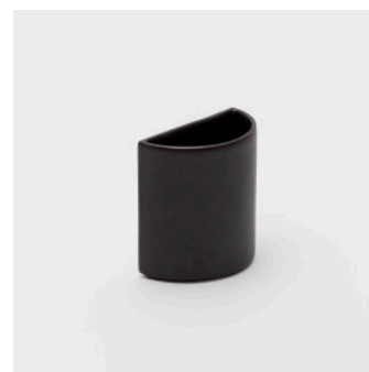
PN: TA/033 Name: Vase S Color: Black Size: φ100 H100 Price: ¥3,400