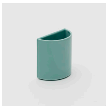
PN: TA/034 Name: Vase S Color: Light Green Size: φ100 H100 Price: ¥3,400