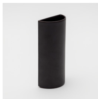
PN: TA/036 Name: Vase L Color: Black Size: φ100 H212 Price: ¥6,000