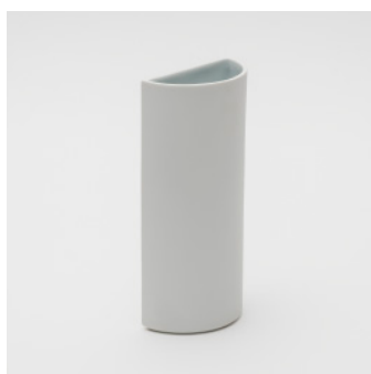
PN: TA/035 Name: Vase L Color: White Size: φ100 H212 Price: ¥5,500