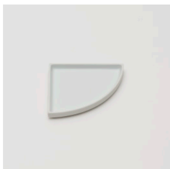
PN: TA/022 Name: Quarter Plate 100 Color: White Size: W100 D100 H11.5 Price: ¥1,200