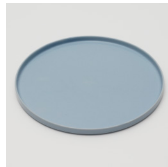
PN: TA/012 Name: Plate 260 Color: Gray Size: φ260 H14 Price: ¥6,000