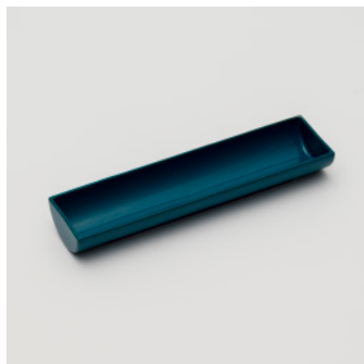
PN: TA/029 Name: Pen Holder Color: Dark Green Size: W200 D50 H25 Price: ¥2,200