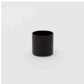
PN: TA/002 Name: Cup S Color: Black Size: φ53 H53 Price: ¥1,500