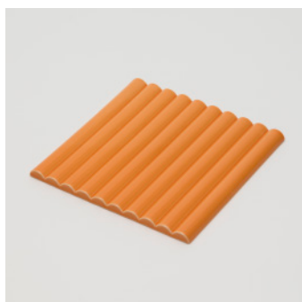
PN: TA/031 Name: Tray Color: Beige Size: W200 D200 H10 Price: ¥3,200