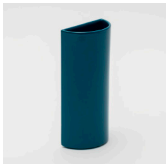
PN: TA/037 Name: Vase L Color: Dark Green Size: \phi 100 H212 Price: ¥6,000