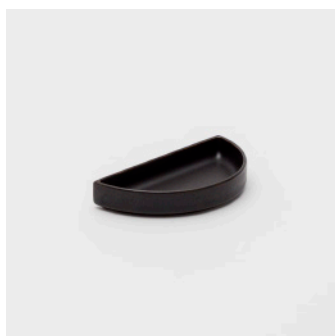
PN: TA/014 Name: Half Plate 100 Color: Black Size: φ100 H16 Price: ¥1,200