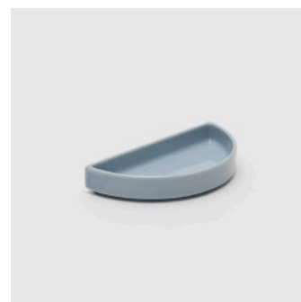
PN: TA/015 Name: Half Plate 100 Color: Gray Size: φ100 H16 Price: ¥1,200