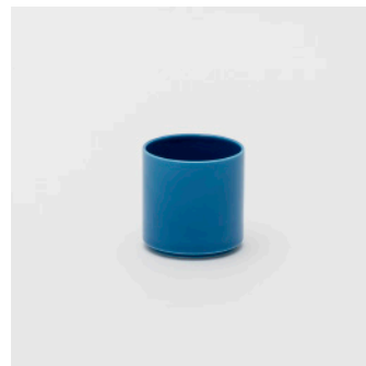
PN: TA/003 Name: Cup S Color: Light Blue Size: φ53 H53 Price: ¥1,500