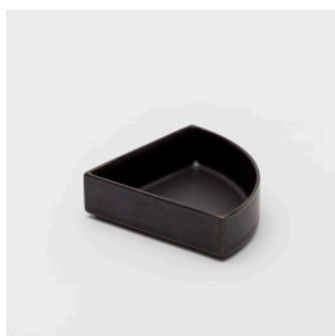
PN: TA/026 Name: Quarter Deep Plate 100 Color: Black Size: W100 D100 H28