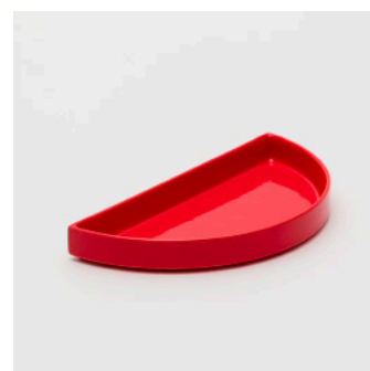
PN: TA/018 Name: Half Plate 200 Color: Red Size: \phi 200 H24