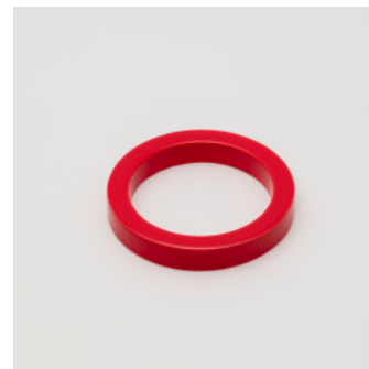
PN: TA/039 Name: Ring Color: Red Size: \phi 132 H20