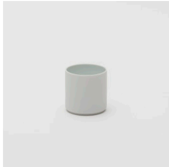
PN: TA/001 Name: Cup S Color: White Size: \phi 53 H53