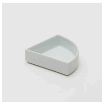
PN: TA/025 Name: Quarter Deep Plate 100 Color: White Size: W100 D100 H28