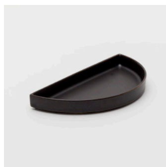
PN: TA/017 Name: Half Plate 200 Color: Black Size: \phi 200 H24