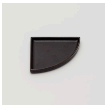
PN: TA/023 Name: Quarter Plate 100 Color: Black Size: W100 D100 H11.5