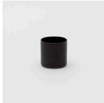
PN: TA/002 Name: Cup S Color: Black Size: \phi 53 H53