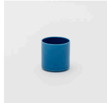
PN: TA/003 Name: Cup S Color: Light Blue Size: \phi 53 H53