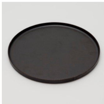
PN: TA/011 Name: Plate 260 Color: Black Size: \phi 260 H14