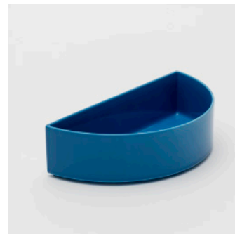
PN: TA/021 Name: Half Deep Plate 200 Color: Light Blue Size: \phi 200 H53