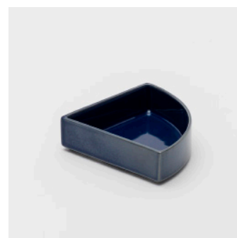
PN: TA/027 Name: Quarter Deep Plate 100 Color: Dark Blue Size: W100 D100 H28