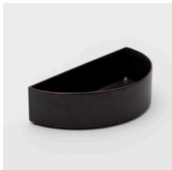
PN: TA/020 Name: Half Deep Plate 200 Color: Black Size: \phi 200 H53