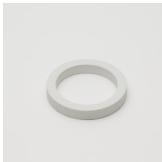
PN: TA/038 Name: Ring Color: White Size: \phi 132 H20