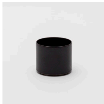
PN: TA/005 Name: Cup L Color: Black Size: \phi 75 H63