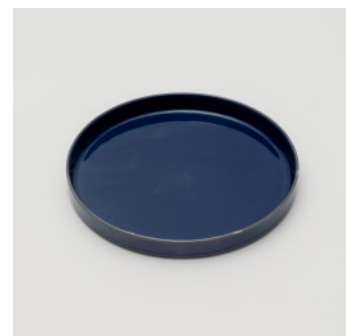
PN: TA/009 Name: Plate 180 Color: Dark Blue Size: \phi 180 H20