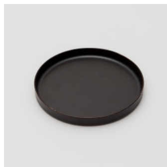
PN: TA/008 Name: Plate 180 Color: Black Size: \phi 180 H20