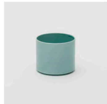
PN: TA/006 Name: Cup L Color: Light Green Size: \phi 75 H63