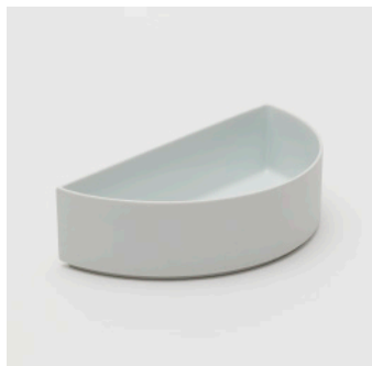
PN: TA/019 Name: Half Deep Plate 200 Color: White Size: \phi 200 H53