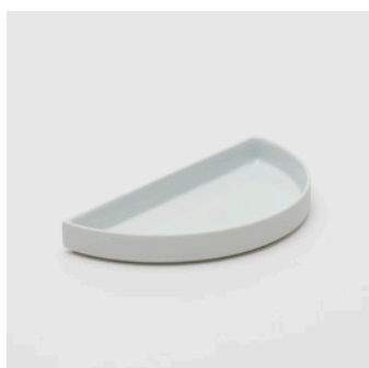
PN: TA/016 Name: Half Plate 200 Color: White Size: \phi 200 H24