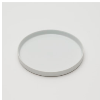
PN: TA/007 Name: Plate 180 Color: White Size: \phi 180 H20