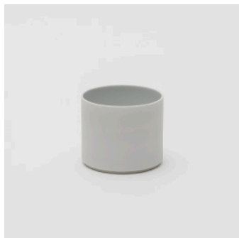
PN: TA/004 Name: Cup L Color: White Size: \phi 75 H63