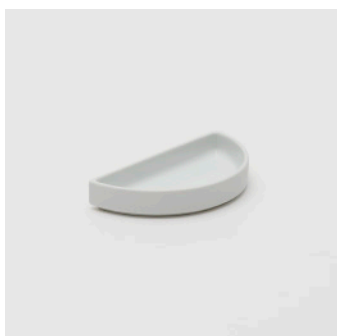
PN: TA/013 Name: Half Plate 100 Color: White Size: \phi 100 H16