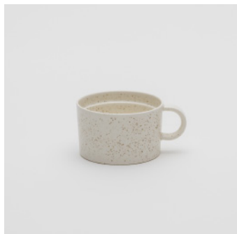
PN: BG/001 Name: Coffee Cup S Color: White Sprinkle Size: φ85 W110 H52 Price: ¥2,400