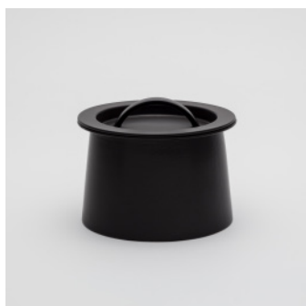
PN: BG/014 Name: Cooking Pot 210 Color: Black Matt Size: φ210 H150 Price: ¥26,000