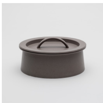
PN: BG/016 Name: Cooking Pot 240 Color: Gray Sprinkle Size: φ240 H110 Price: ¥23,000