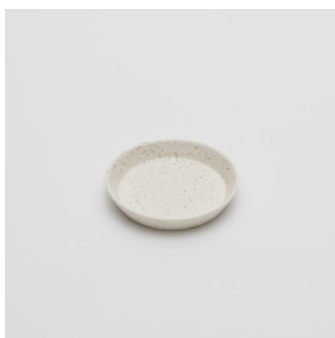
PN: BG/005 Name: Saucer Color: White Sprinkle Size: φ100 H11 Price: ¥950