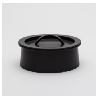
PN: BG/017 Name: Cooking Pot 240 Color: Black Matt Size: φ240 H110 Price: ¥24,000