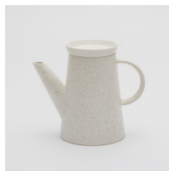
PN: BG/009 Name: Coffee Pot Color: White Sprinkle Size: φ120 W210 H172 Price: ¥14,200