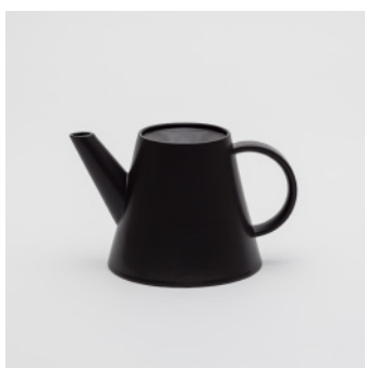
PN: BG/008 Name: Kettle Color: Black Matt Size: φ147 W210 H125 Price: ¥11,700