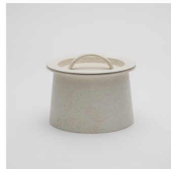
PN: BG/012 Name: Cooking Pot 210 Color: White Sprinkle Size: φ210 H150 Price: ¥25,000