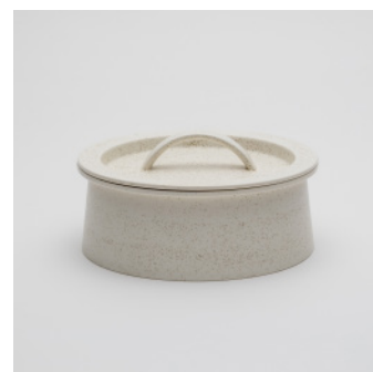
PN: BG/015 Name: Cooking Pot 240 Color: White Sprinkle Size: φ240 H110 Price: ¥23,000