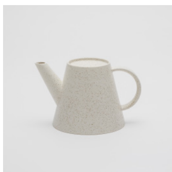
PN: BG/007 Name: Kettle Color: White Sprinkle Size: φ147 W210 H125 Price: ¥11,200