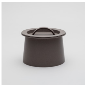
PN: BG/013 Name: Cooking Pot 210 Color: Gray Sprinkle Size: φ210 H150 Price: ¥25,000