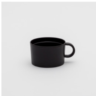
PN: BG/002 Name: Coffee Cup S Color: Black Matt Size: φ85 W110 H52 Price: ¥2,500