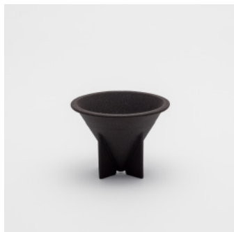
PN: BG/011 Name: Coffee Dripper Color: Dark Gray Size: φ130 H100 Price: ¥4,200