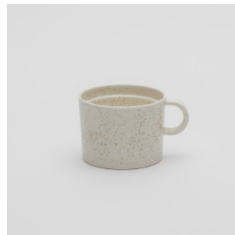
PN: BG/003 Name: Coffee Cup L Color: White Sprinkle Size: φ85 W110 H65 Price: ¥2,600