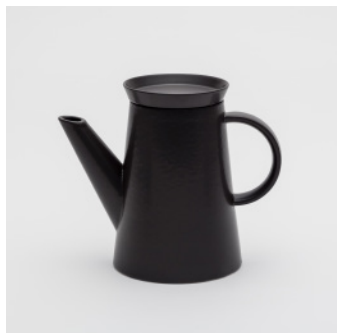
PN: BG/010 Name: Coffee Pot Color: Black Matt Size: φ120 W210 H172 Price: ¥14,700