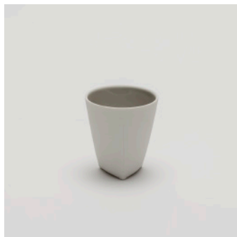
PN: CH/002 Name: Espresso Cup Color: Gray Size: φ60 H65 Price: ¥1,700