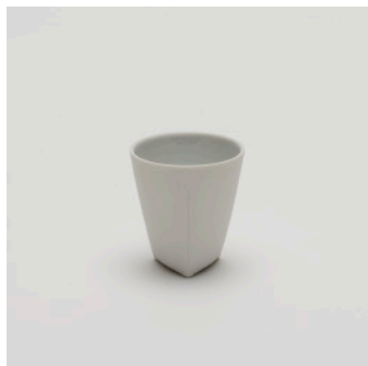
PN: CH/001 Name: Espresso Cup Color: White Size: φ60 H65 Price: ¥1,700