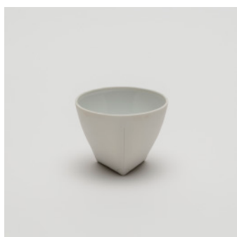
PN: CH/007 Name: Tea Cup Color: White Size: φ90 H70 Price: ¥2,000