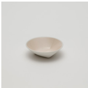
PN: CH/020 Name: Deep Plate 90 Color: Pink Size: φ90 H25 Price: ¥1,300