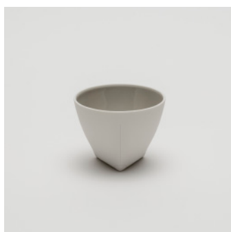
PN: CH/008 Name: Tea Cup Color: Gray Size: φ90 H70 Price: ¥2,000