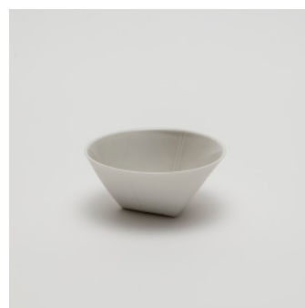
PN: CH/027 Name: Bowl 120 Color: Gray Size: φ120 H52 Price: ¥2,200