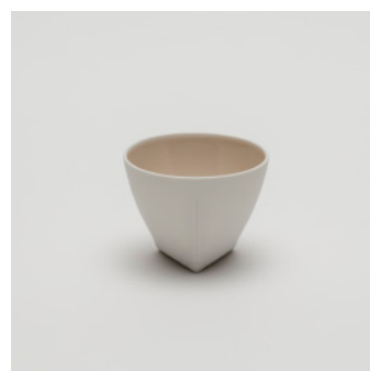
PN: CH/009 Name: Tea Cup Color: Pink Size: φ90 H70 Price: ¥2,000