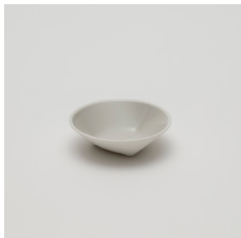
PN: CH/019 Name: Deep Plate 90 Color: Gray Size: φ90 H25 Price: ¥1,300