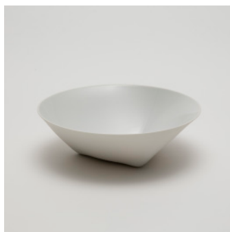
PN: CH/035 Name: Bowl 240 Color: White Size: \phi 240 H75 Price: ¥6,000