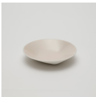
PN: CH/023 Name: Deep Plate 150 Color: Pink Size: φ150 H30 Price: ¥2,300