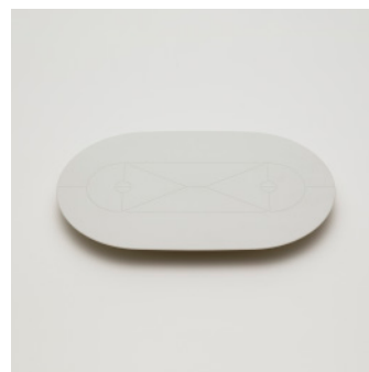
PN: CH/036 Name: Serving Tray Color: White Size: W285 D180 H25 Price: ¥4,300