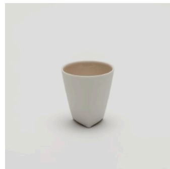
PN: CH/003 Name: Espresso Cup Color: Pink Size: φ60 H65 Price: ¥1,700