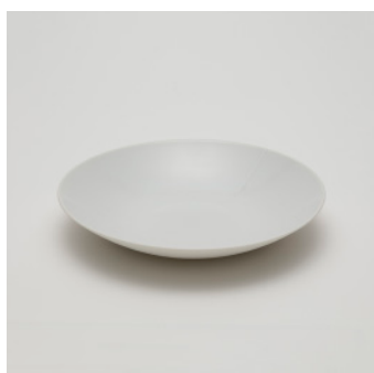
PN: CH/025 Name: Deep Plate 240 Color: White Size: φ240 H39 Price: ¥4,500