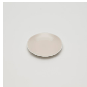
PN: CH/012 Name: Plate 120 Color: Pink Size: \phi 120 H15 Price: ¥1,500