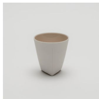
PN: CH/006 Name: Coffee Cup Color: Pink Size: φ85 H85 Price: ¥2,000