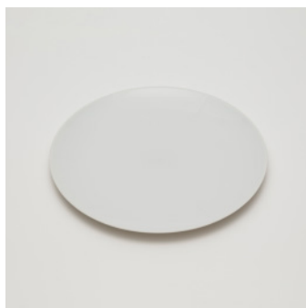
PN: CH/017 Name: Plate 270 Color: White Size: \phi 270 H21 Price: ¥5,500