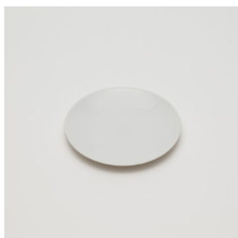
PN: CH/013 Name: Plate 150 Color: White Size: \phi 150 H15 Price: ¥1,900