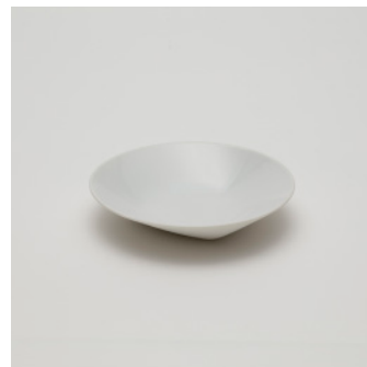
PN: CH/021 Name: Deep Plate 150 Color: White Size: φ150 H30 Price: ¥2,300