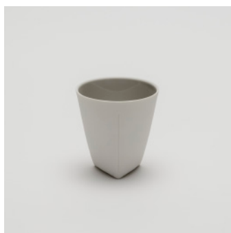
PN: CH/005 Name: Coffee Cup Color: Gray Size: φ85 H85 Price: ¥2,000