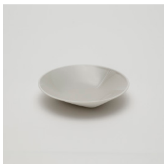
PN: CH/022 Name: Deep Plate 150 Color: Gray Size: φ150 H30 Price: ¥2,300