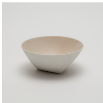
PN: CH/034 Name: Bowl 180 Color: Pink Size: \phi 180 H75 Price: ¥3,600