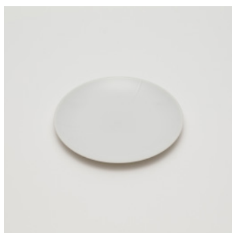
PN: CH/014 Name: Plate 180 Color: White Size: \phi 180 H15 Price: ¥2,100