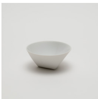
PN: CH/026 Name: Bowl 120 Color: White Size: φ120 H52 Price: ¥2,200