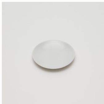
PN: CH/010 Name: Plate 120 Color: White Size: \phi 120 H15 Price: ¥1,500