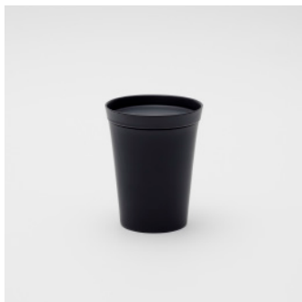
PN: IR/011 Name: Tea Container Color: Black Matt Size: φ107 H136 Price: ¥15,800