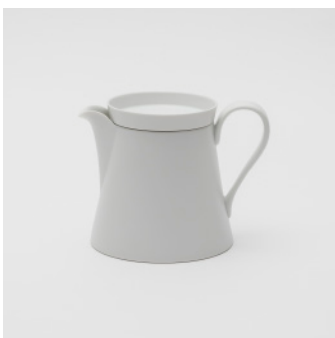
PN: IR/017 Name: Tea Pot L Color: White Matt Size: φ125 W165 H125 Price: ¥32,500