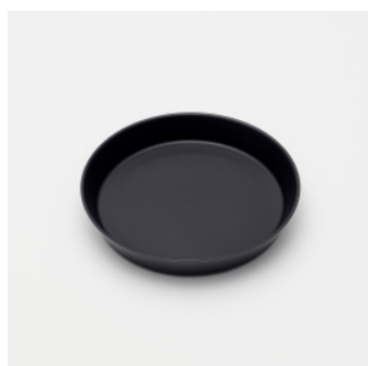
PN: IR/007 Name: Plate 160 Color: Black Matt Size: φ165 H29 Price: ¥7,000