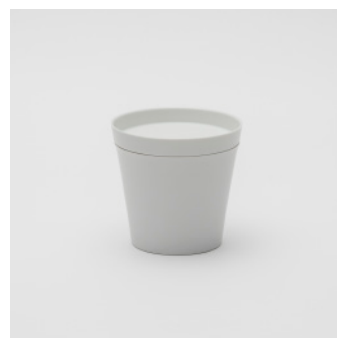
PN: IR/006 Name: Tea Cup L Color: White Matt Size: φ105 H100 Price: ¥12,500