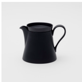
PN: IR/016 Name: Tea Pot L Color: Black Matt Size: φ125 W165 H125 Price: ¥33,000