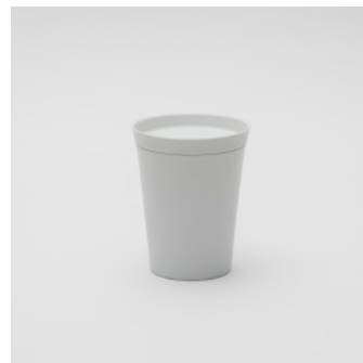
PN: IR/012 Name: Tea Container Color: White Matt Size: φ107 H136 Price: ¥15,300