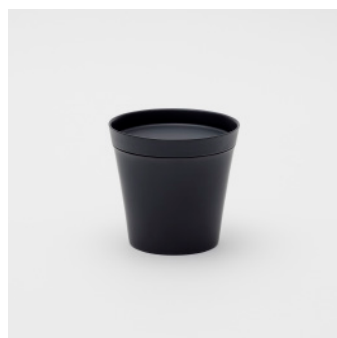
PN: IR/005 Name: Tea Cup L Color: Black Matt Size: φ105 H100 Price: ¥13,000