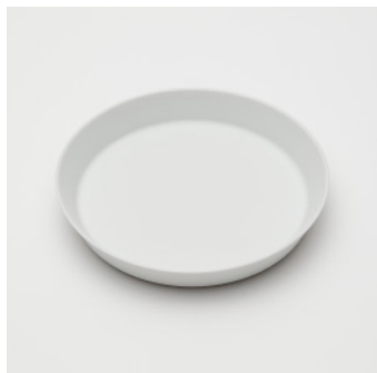
PN: IR/010 Name: Plate 210 Color: White Matt Size: φ210 H33 Price: ¥9,000