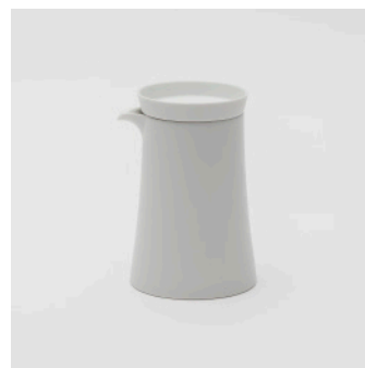
PN: IR/018 Name: Jug Color: White Matt Size: φ76 W90 H140 Price: -