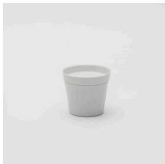
PN: IR/002 Name: Tea Cup S Color: White Matt Size: φ75 H70 Price: ¥9,000