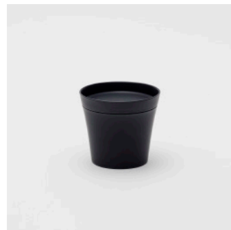
PN: IR/003 Name: Tea Cup M Color: Black Matt Size: φ95 H85 Price: ¥11,000