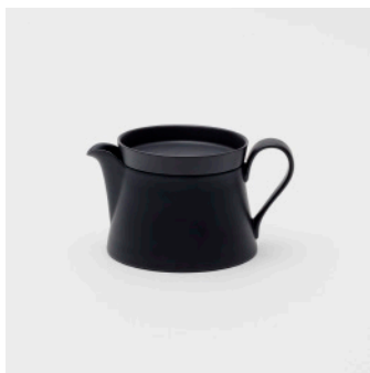
PN: IR/014 Name: Tea Pot S Color: Black Matt Size: φ110 W150 H85 Price: ¥27,500