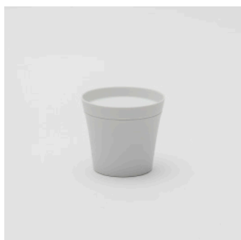
PN: IR/004 Name: Tea Cup M Color: White Matt Size: φ95 H85 Price: ¥10,500