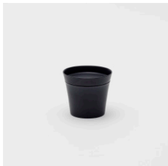
PN: IR/001 Name: Tea Cup S Color: Black Matt Size: φ75 H70 Price: ¥9,500