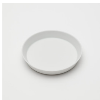
PN: IR/008 Name: Plate 160 Color: White Matt Size: φ165 H29 Price: ¥6,500