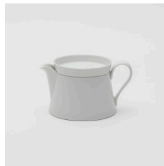
PN: IR/015 Name: Tea Pot S Color: White Matt Size: φ110 W150 H85 Price: ¥27,000