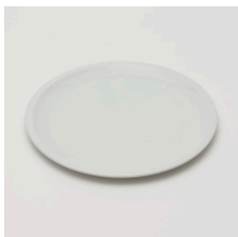
PN: PD/013 Name: Plate Color: White Size: φ240 H25 Price: ¥2,600