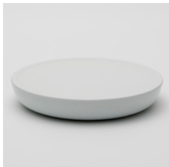
PN: PD/019 Name: Tray Color: White Size: φ260 H42 Price: ¥20,000