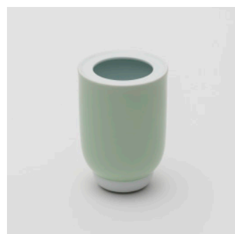
PN: PD/027 Name: Flower Vase S Color: White/Celadon/White Size: φ105 H150 Price: ¥6,200