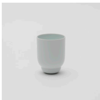
PN: PD/004 Name: Cup L Color: White Size: φ78 H102 Price: ¥2,100