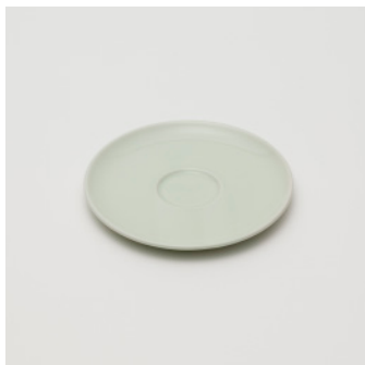
PN: PD/011 Name: Saucer Color: Celadon Size: φ150 H8 Price: ¥1,500