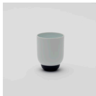
PN: PD/006 Name: Cup L Color: White/Dark Blue Size: φ78 H102 Price: ¥2,500