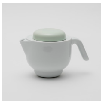
PN: PD/026 Name: Tea Pot Color: Celadon/White Size: φ138 W215 H137 Price: ¥16,000