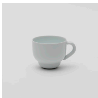
PN: PD/007 Name: Tea Cup Color: White Size: φ92 W115 H75 Price: ¥2,900