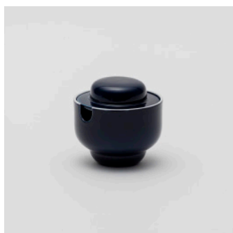
PN: PD/023 Name: Sugar Pot Color: Dark Blue Size: φ98 H100 Price: ¥6,200