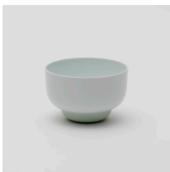
PN: PD/017 Name: Bowl 120 Color: White/Celadon Size: φ125 H80 Price: ¥3,500