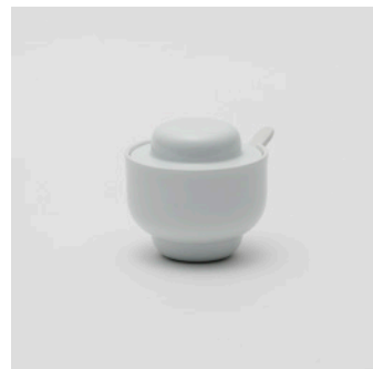
PN: PD/021 Name: Sugar Pot Color: White Size: φ98 H100 Price: ¥5,700