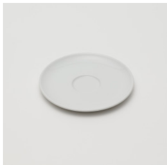
PN: PD/010 Name: Saucer Color: White Size: φ150 H8 Price: ¥1,500