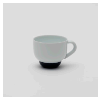
PN: PD/009 Name: Tea Cup Color: White/Dark Blue Size: φ92 W115 H75 Price: ¥3,300