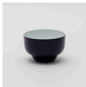
PN: PD/018 Name: Bowl 120 Color: Dark Blue Size: φ125 H80 Price: ¥3,500