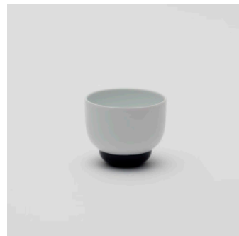
PN: PD/003 Name: Cup S Color: White/Dark Blue Size: φ90 H73 Price: ¥2,500