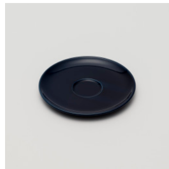
PN: PD/012 Name: Saucer Color: Dark Blue Size: φ150 H8 Price: ¥1,500