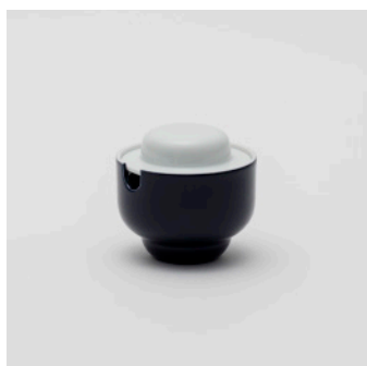
PN: PD/022 Name: Sugar Pot Color: White/Dark Blue Size: φ98 H100 Price: ¥6,200