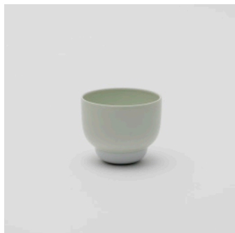
PN: PD/002 Name: Cup S Color: Celadon/White Size: φ90 H73 Price: ¥2,500