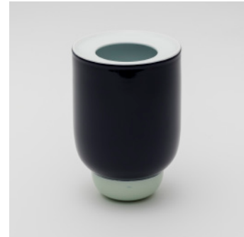
PN: PD/030 Name: Flower Vase L Color: White/Dark Blue/Celadon Size: φ160 H230 Price: ¥35,000