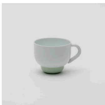
PN: PD/008 Name: Tea Cup Color: White/Celadon Size: φ92 W115 H75 Price: ¥3,300