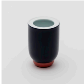
PN: PD/029 Name: Flower Vase S Color: White/Dark Blue/Red Size: φ105 H150 Price: ¥6,800