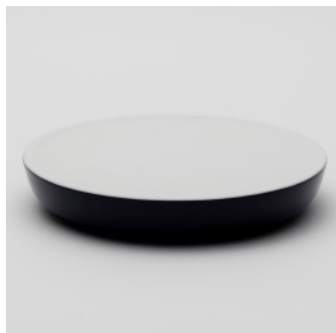
PN: PD/020 Name: Tray Color: Dark Blue Size: φ260 H42 Price: ¥20,000