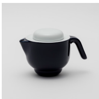
PN: PD/025 Name: Tea Pot Color: White/Dark Blue Size: φ138 W215 H137 Price: ¥16,000