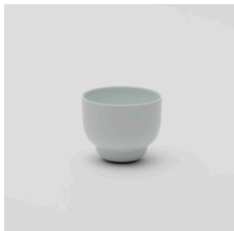
PN: PD/001 Name: Cup S Color: White Size: φ90 H73 Price: ¥2,100