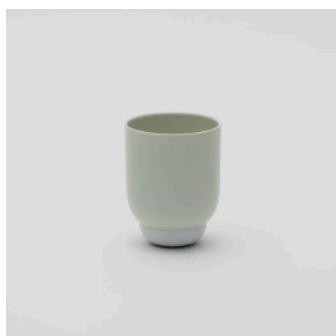
PN: PD/005 Name: Cup L Color: Celadon/White Size: φ78 H102 Price: ¥2,500