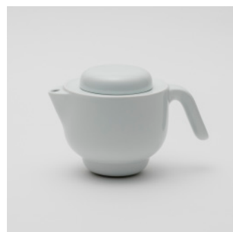
PN: PD/024 Name: Tea Pot Color: White Size: φ138 W215 H137 Price: ¥15,000