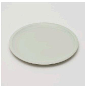
PN: PD/014 Name: Plate Color: Celadon Size: φ240 H25 Price: ¥2,600