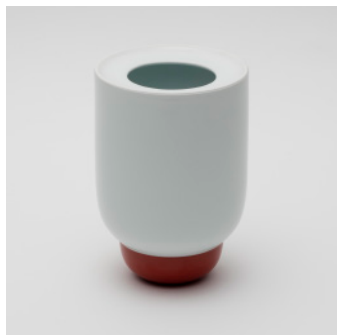
PN: PD/031 Name: Flower Vase L Color: White/White/Red Size: φ160 H230 Price: ¥35,000