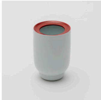
PN: PD/028 Name: Flower Vase S Color: Red/White/White Size: φ105 H150 Price: ¥6,600