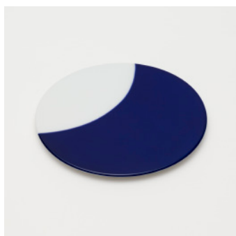
PN: WS/004 Name: Plate 180 Color: Mask Size: φ178 H10 Price: ¥17,000