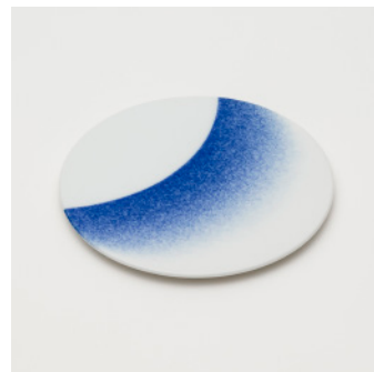
PN: WS/003 Name: Plate 180 Color: Spray Size: φ178 H10 Price: ¥17,000