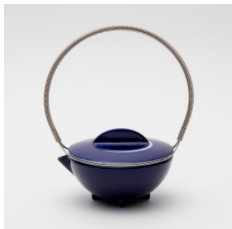
PN: WS/010 Name: Tea Pot Color: Mask Size: φ160 W180 H180 Price: ¥80,000