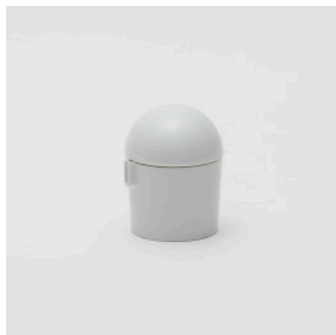
PN: WS/011 Name: Milk Pot Color: Spray Size: φ67 H80 Price: ¥18,000