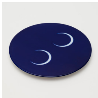
PN: WS/016 Name: Sugar/Milk Pot Tray Color: Mask Size: φ230 H16 Price: ¥24,000