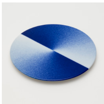
PN: WS/007 Name: Cake Tray Color: Spray Size: φ230 H16 Price: ¥24,000