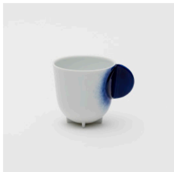
PN: WS/001 Name: Tea Cup Color: Spray Size: φ75 W100 H75 Price: ¥20,000