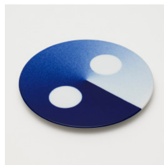
PN: WS/015 Name: Sugar/Milk Pot Tray Color: Spray Size: φ230 H16 Price: ¥24,000