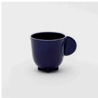
PN: WS/002 Name: Tea Cup Color: Mask Size: φ75 W100 H75 Price: ¥18,000