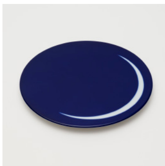
PN: WS/008 Name: Cake Tray Color: Mask Size: φ230 H16 Price: ¥24,000