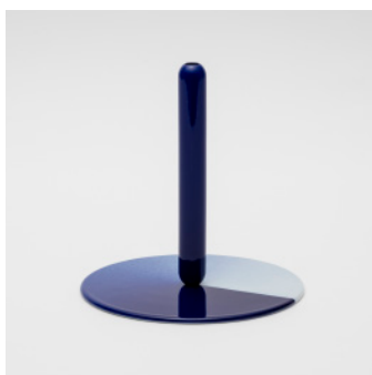
PN: WS/005 Name: Flower Vase Color: Spray Size: φ200 H205 Price: ¥60,000