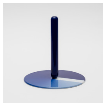
PN: WS/006 Name: Flower Vase Color: Mask Size: φ200 H205 Price: ¥60,000