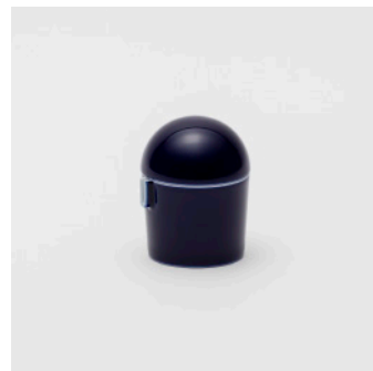
PN: WS/012 Name: Milk Pot Color: Mask Size: φ67 H80 Price: ¥20,000