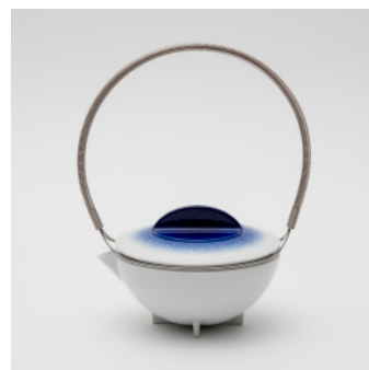
PN: WS/009 Name: Tea Pot Color: Spray Size: φ160 W180 H180 Price: ¥75,000