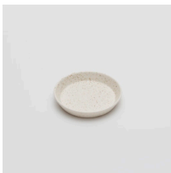
PN: BG/005 Name: Saucer Color: White Sprinkle Size: φ100 H11