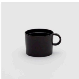
PN: BG/004 Name: Coffee Cup L Color: Black Matt Size: φ85 W110 H65