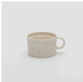
PN: BG/001 Name: Coffee Cup S Color: White Sprinkle Size: φ85 W110 H52