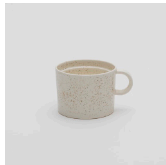
PN: BG/003 Name: Coffee Cup L Color: White Sprinkle Size: φ85 W110 H65