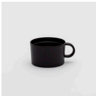
PN: BG/002 Name: Coffee Cup S Color: Black Matt Size: φ85 W110 H52